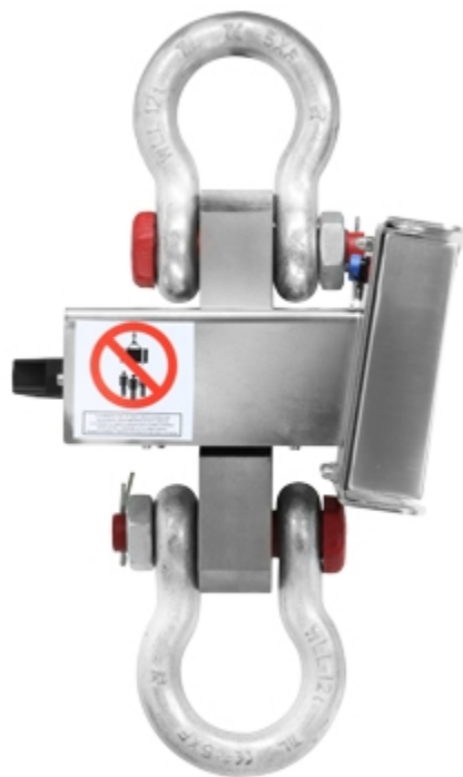
Crane scale MCW09: side view