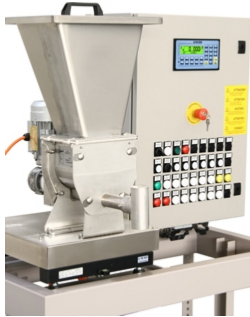
E-LW application example

E-LW: dosage and adjustment of the flow of material exiting from silos, tanks, hoppers.