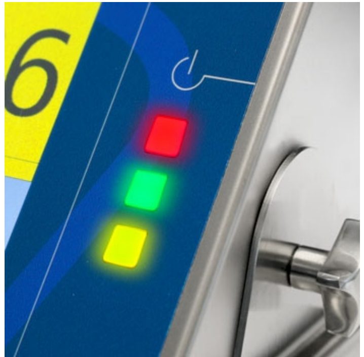
High brightness LED crosslight.