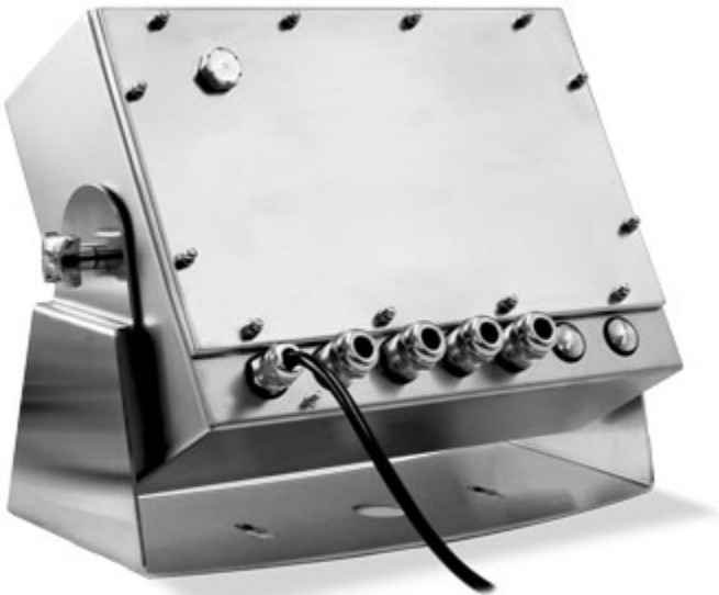
Rear panel configured for extra outputs