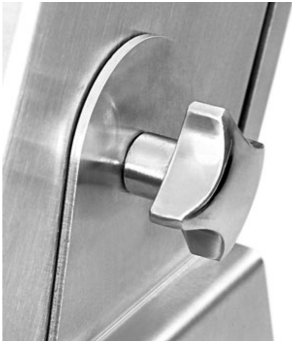
STAINLESS steel inclination adjustment system