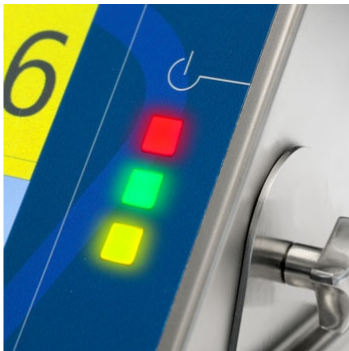
High brightness LED crosslight.