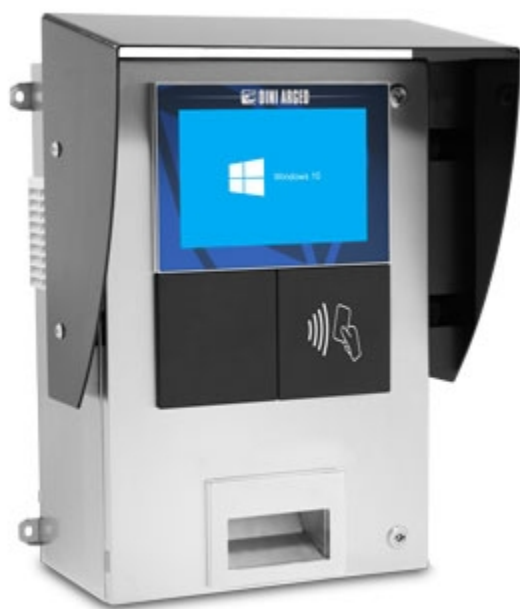
6116BOX: with RFID reader.