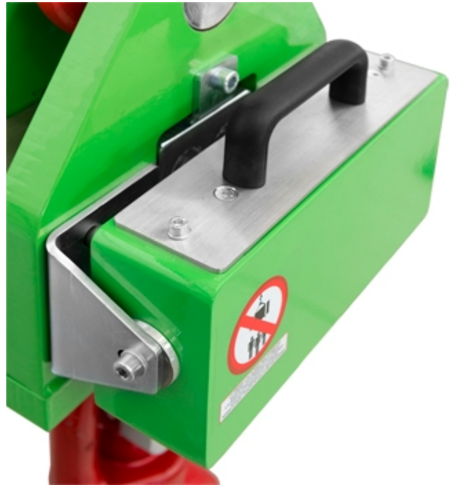
Fitted with extractable rechargeable battery pack.