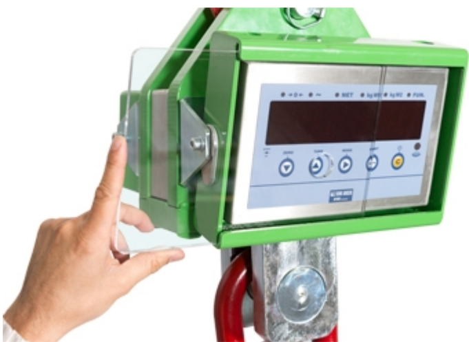
Protective screen in plexiglas for display and keyboard.