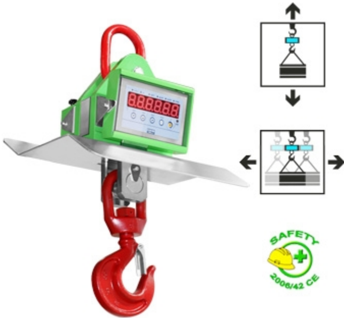
MCWHU with optional ring, swivelling hook and thermal shield