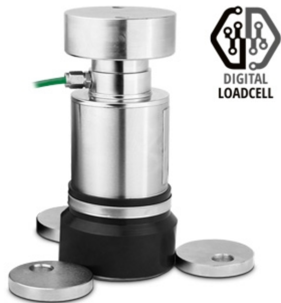
Assembly kit for RCPTDx0C3NC cells.