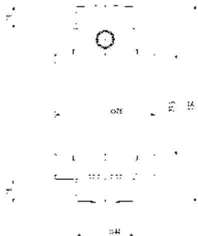
Technical drawing in mm.