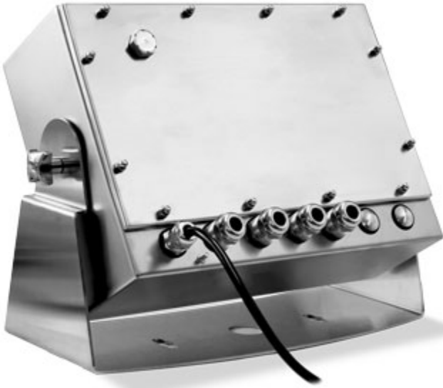
Rear panel configured for extra outputs