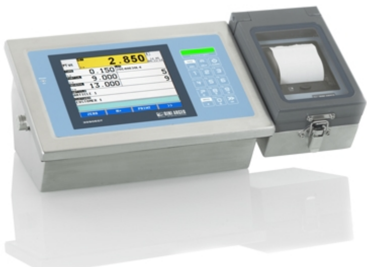
3590EGT with IP65 INOX printer