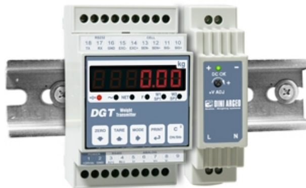
DGT1 with DR1512 optional power supply, for DIN bar